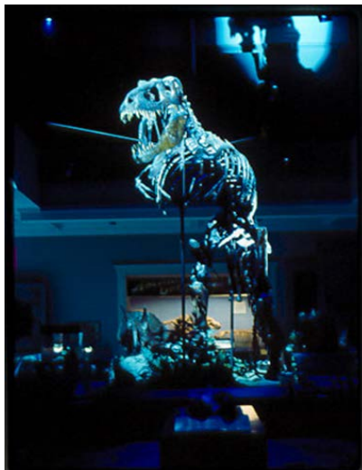
Carnegie Museum of Natural History Dino Hall Light Show - T- Rex (IES Local & Regional Award Winner) & (Honorable Mention on the National Level)