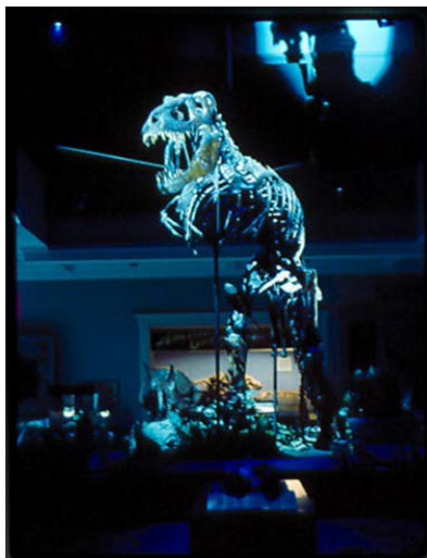
Carnegie Museum of Natural History Dino Hall Light Show - T- Rex (IES Local & Regional Award Winner) & (Honorable Mention on the National Level)